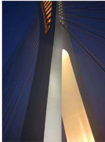
External masonry work on bridge.