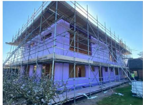
Timber frame install.