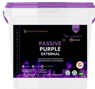
Passive Purple External.