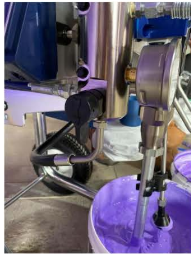
Graco ST Max II 495 airless spray machine or similar in process.