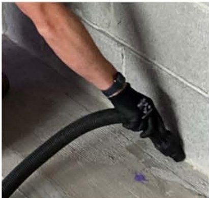
Vacuum all debris.