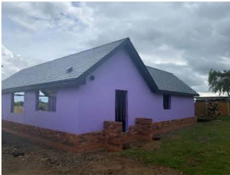
Timber frame install.

Passive Purple® External has a class-Bs1 fire rating allowing it to self-extinguish when ignited giving little to no contribution to the reproduction of flames and a high contribution to building safety on all building types from small garden offices through to skyscrapers.