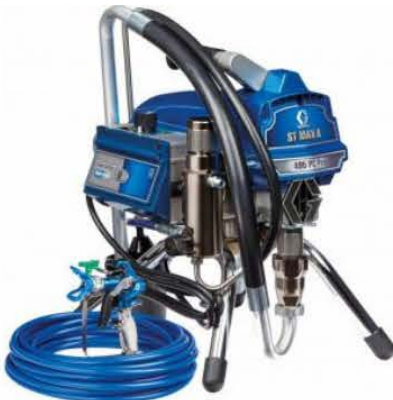
Graco ST Max II 495 airless spray machine or similar.