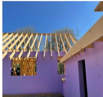
Timber frame install.