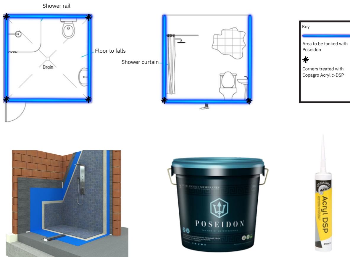
Figure 2: Typical wet room

Gypsum based plaster and plasterboard or calcium sulphate screed should not be used as a substrate in a wet room or where a power shower is to be installed, regardless of any tanking provision.